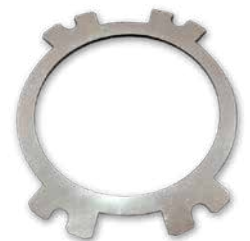
Magnetic Retaining Ring