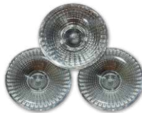
Number of Lenses Ordered